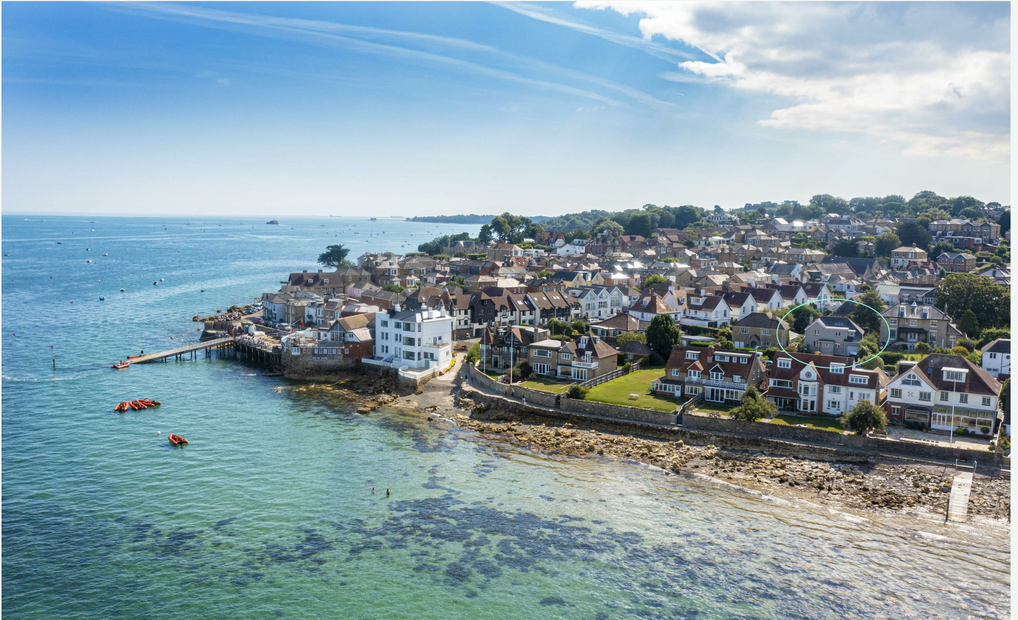
The Police House, Bluett Avenue, Seaview, Isle Of Wight, PO34 5HE